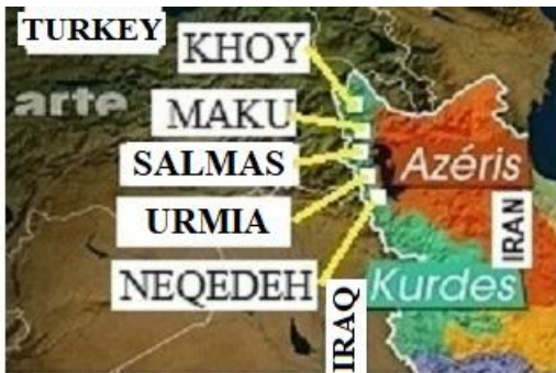
Province 90% Azerbaijani (in Iran) pretended as kurdish lands by the French media

The French media shows a part of Azerbaijan (in Iran) as the land of Kurds. This is false, these cities and villages ( Khoy, Maku, Salmas, Urmia and Neqedeh ) in border with Turkey, were still populated by 90% Azerbaijanis and 10% Kurds who live there, are Iraqi Kurdish refugees from Saddam's time that are installed by the Iranian regime to change the demography of the region. In these cities, no Kurdish mayor as always.