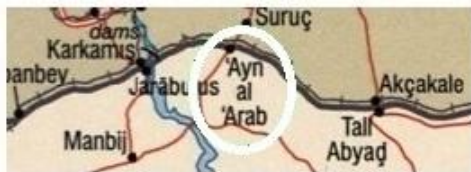
Published by the Library of Congress in Washington - 2007

These anti-Turkish and anti-Arab media publish fake maps of the Middle East claiming these lands as that of the Kurds: Look at these two pictures of a part of the map of Syria.