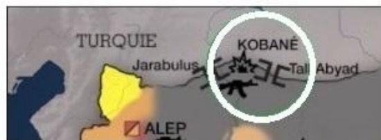
Published by France 24 October 2014

The first was published by the Library of Congress in Washington in 2007. The northern city of Syria bordering Turkey is called (Eyn Al Arab), not (Kobane). The second image is published in the French media with the false name of (Kobane), and not (Eyn Al Arab).